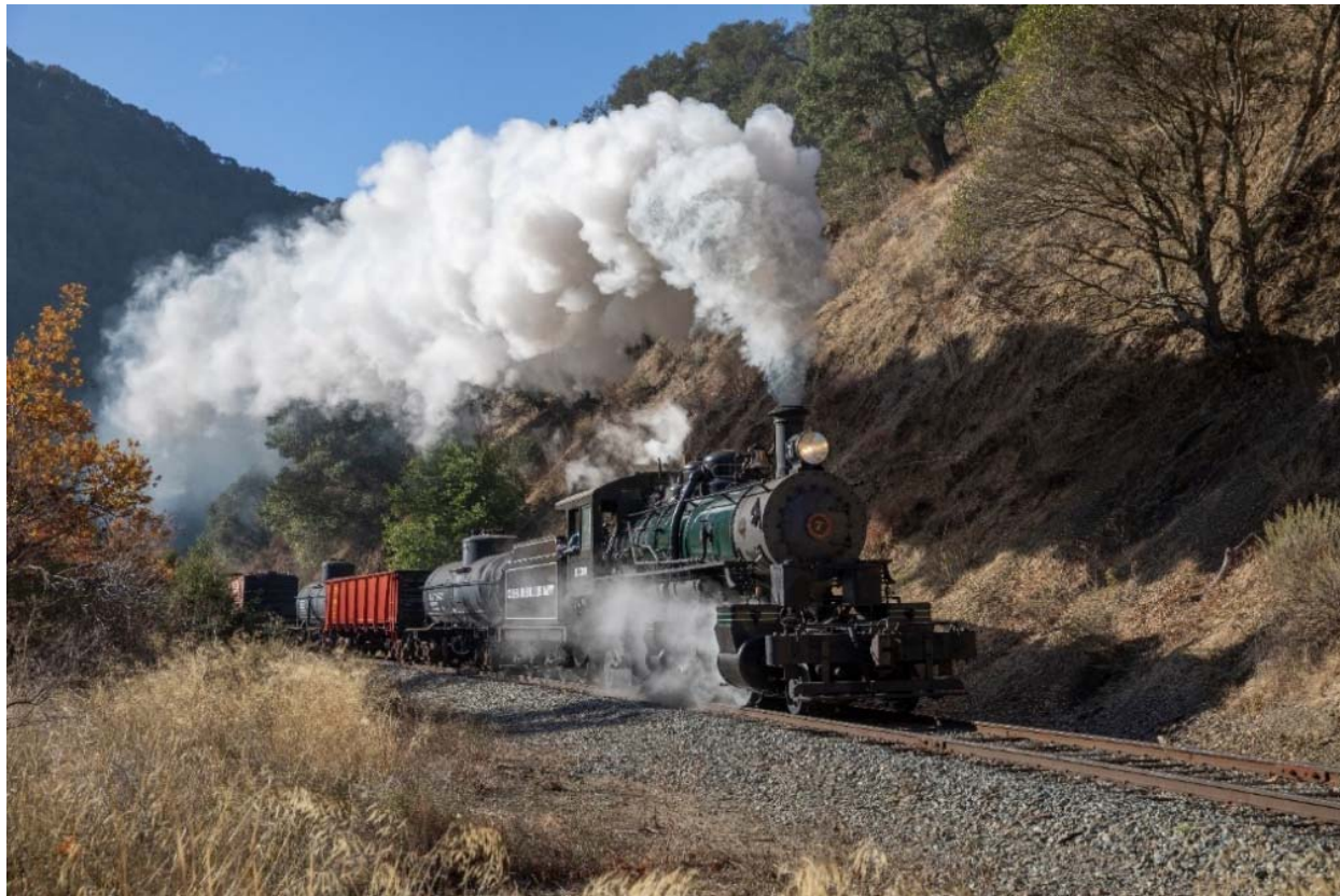
Right: On 05 December, 2020, Columbia River Belt Line Railway 7, "Skookum," is seen operating eastbound through Niles Canyon between Fremont and Sunol, California.

Niles Canyon continues to restore and operate an interesting selection of steam and diesel locomotives.