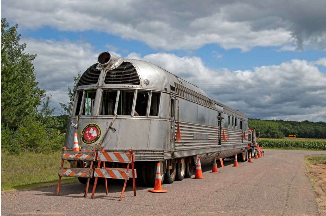
Above: The power car from the Mark Twain Zephyr upon its arrival at Trego, Wisconsin. 20. August, 2020.

During summer, 2020, Wisconsin Great Northern Railroad announced the purchase of the Mark Twain Zephyr , one of nine trainsets built in 1934 by The Budd Company, Philadelphia, Pennsylvania for the Chicago, Burlington & Quincy Railroad ( Burlington Route ). Wisconsin Great Northern operates diesel-powered tourist trains in northwest Wisconsin. They plan to restore the Mark Twain Zephyr to service,