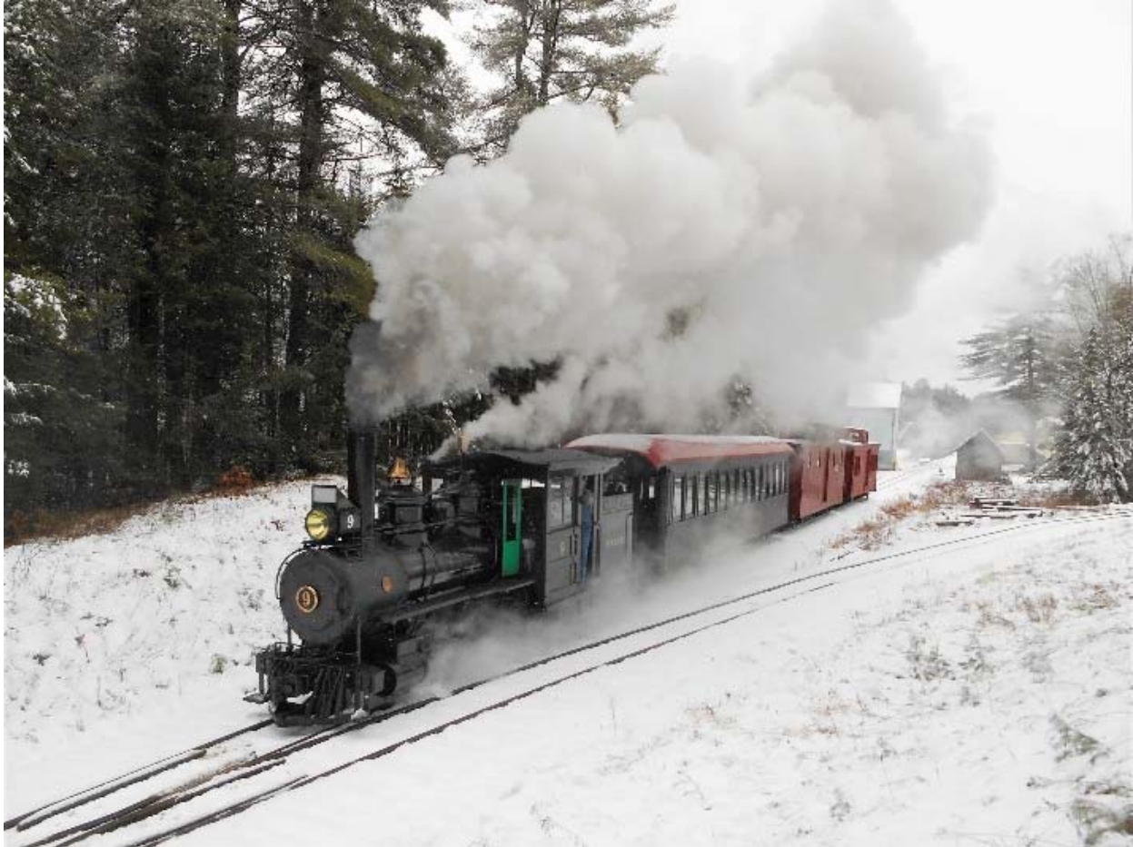
Above: WW&F 9 was in steam at Alna, Maine. 02. January, 2021.

The “Steam and Sleighs & Winter Caboose Adventures” event scheduled for 16. January, 2021 was cancelled account significant rain experienced on that weekend. This event was re-scheduled for 30. January and 06. February, 2021.