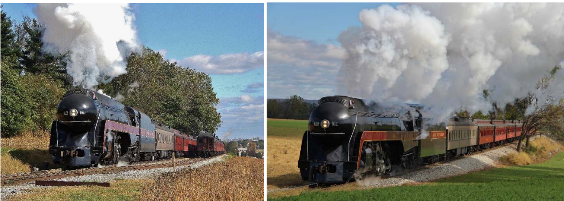
Above: N&W 611 in steam on the Strasburg Rail Road, Strasburg, Pennsylvania. 18. October, 2019.

Reservations are required. Spaces will fill quickly. Purchase your experiences by visiting the Strasburg Rail Road website.