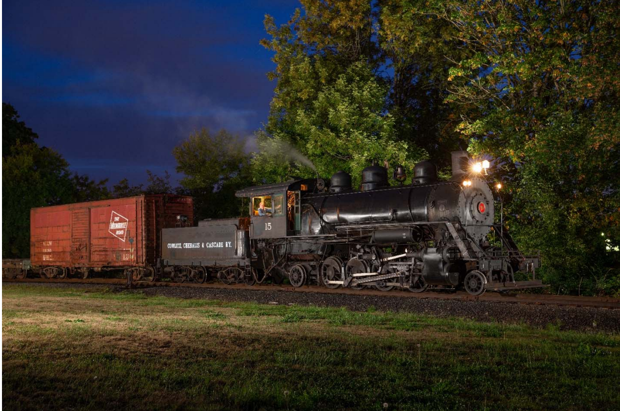
Above: Cowlitz, Chehalis & Cascade Railway 15 in steam at Chehalis, Washington. August 25, 2013.