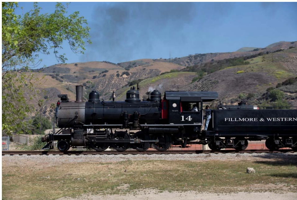
Above: Fillmore & Western Railway 14, Fillmore, California. 23. March, 2013.

Fillmore & Western Railway: http://www.fwry.com/